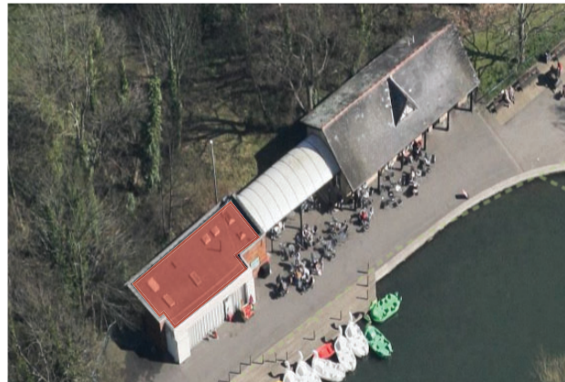
Flat roof of Boathouse for proposed PV panel installation as highlighted

The intention of installing PV panels is for the benefit of the Lakeside Café and the Boathouse, allowing it to continue serving the community and general public as a place for leisure and recreational activities for general public while enjoying the benefit of the self-generated sustainable energy.