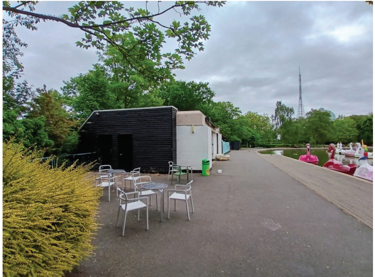
View looking towards southwest

In summary, the proposals represent a sensitive and proportionate intervention that will enable Alexandra Palace to improve its environmental performance without compromising the heritage values of the site. The installation is considered to be acceptable in heritage terms.