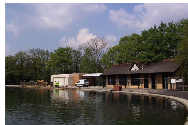
Refurbishment of Boathouse and Lakeside Cafe in 2006

While the existing non-historic elements may not warrant retention based on their own merit, any interventions should be carefully considered for their impact on the surrounding historic landscape and strive to enhance the Victorian parkland character that the Lakeside Café building currently attempts to embody.