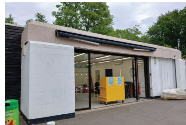
Utilitarian mid-century design style of the Boathouse

The intervention is demonstrably low-impact, reversible, and proportionate. It reflects an appropriate response to the climate emergency that does not undermine the significance of the heritage asset or its setting.