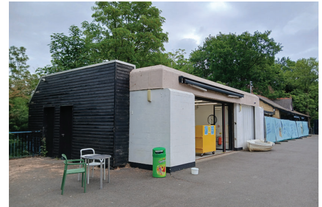
Boathouse southwest facing frontage

This heritage statement has been written to support a pre-application. It describes the works, and discusses the potential impacts on the heritage values of the building and its surrounding setting, showing how the proposal has been designed to minimise harm to them. It has been informed by Historic England's guidance on statements of heritage significance, that the level of detail given is proportionate to the impact of the proposal. 1