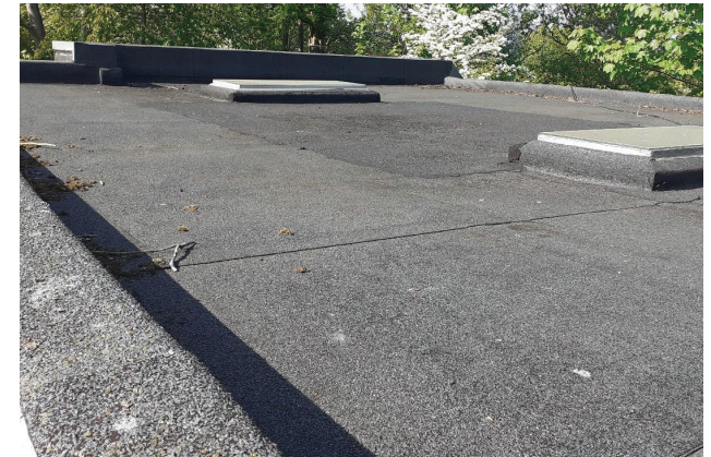
Existing flat roof of bitumen roofing felt